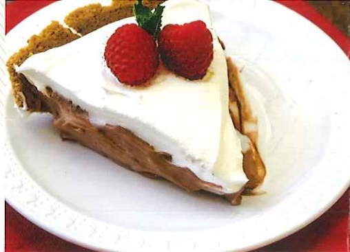
Chocolate Mousse Pie